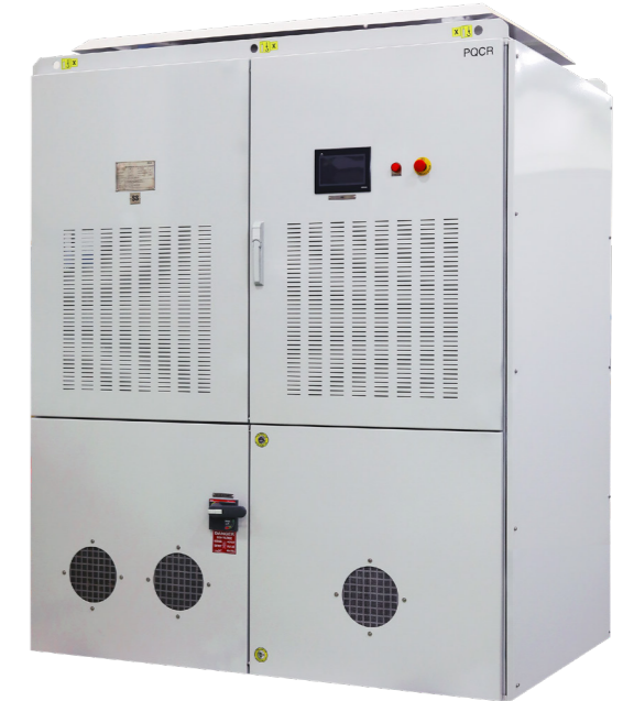
PQCR 690 V single phase