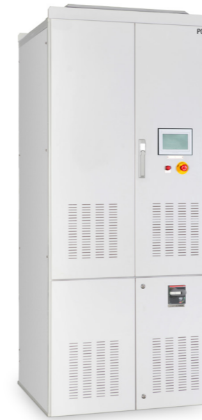
PQCR 440 V

High power requirement at a very low power factor results in a high load current. High current results in additional losses ( I^2R losses) in supply cables and transformers which leads to inefficient operation of the plant. The customer faces an increased energy bill due to higher losses in the system. Moreover the energy losses because of reactive power present in the system may lead to excessive heating of various components which reduces the life expectancy of the electrical equipment. PQCR enhances energy efficiency by improving the power factor dynamically and thereby reduces these energy losses.